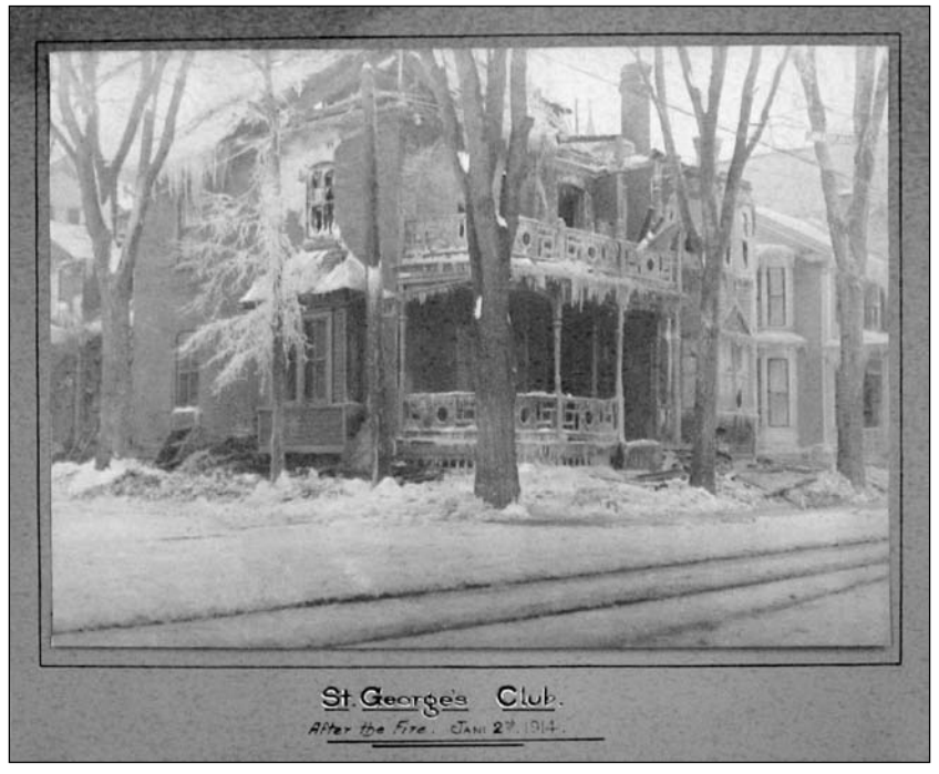
The 1914 Fire

There were also three additional categories of membership: Corporate members, Wives, and Associate members.