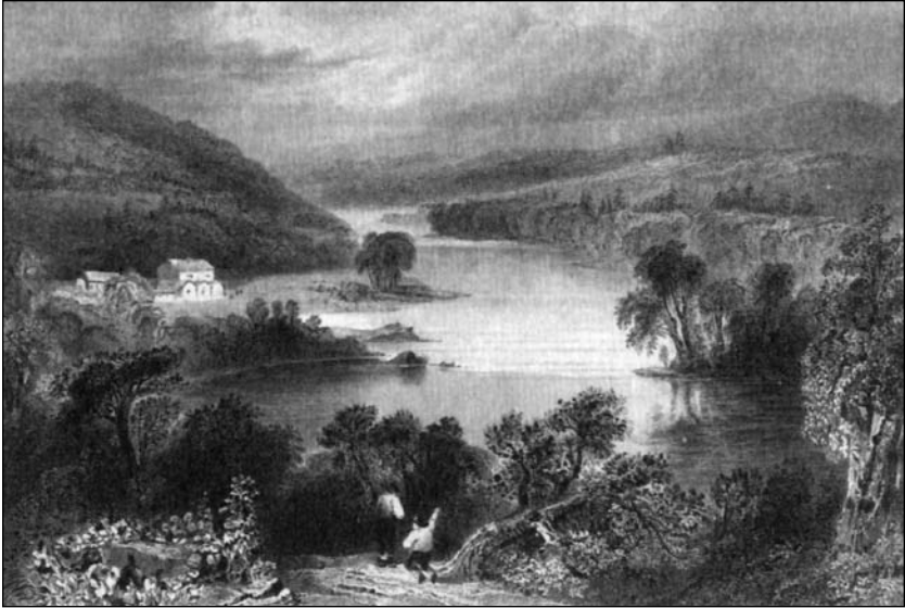
Scene on the River St. Francis near Sherbrooke (Eastern Townships).

(From "Canadian Scenery," 1839–1842, by W.H. Bartlett)