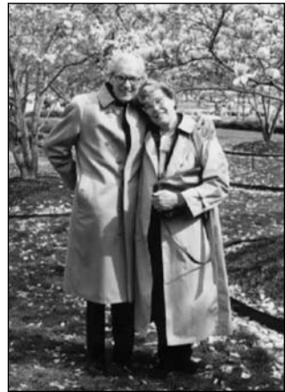
National Gallery, Washington, D.C., April 2, 1989.