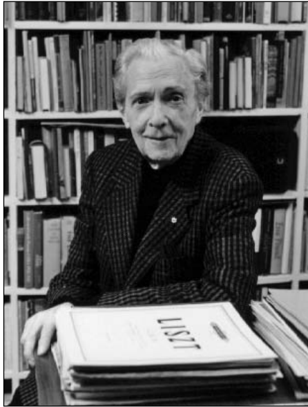
At home in North Hatley