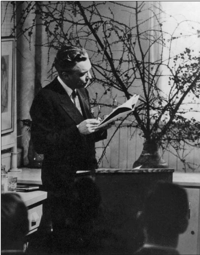
A poet reads.