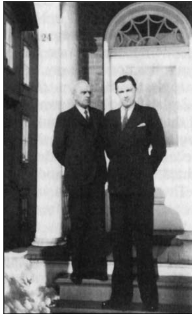
Father and son

The Eastern Townships, perhaps even more than my first years in Labrador, remain the heart and hearth of my citizenship. More than any other person Ralph Gustafson has reinforced that such a sense of place can never die. Ralph wrought magnificently for Canada and our future. At Bishop's University his memory deserves permanent study and appreciation for future generations.