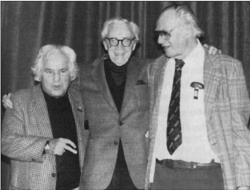
Irving Layton, Ralph Gustafson and Al Purdy at University of Toronto, November 12, 1987.

“the saving grace is poetry,” that the world is “no good without what music we can make of it.” His own under-rated poetry demonstrates these things with elegance, force and accessibility (how he hated the obscure and trendy), revealing, shaping, making sense of ourselves to ourselves. A cheap hostile review of his last book a couple of years ago made me, through my sad anger, realise even more what Ralph Gustafson meant by “the present need of grace.” I shall remember those words always. They are, to me, at the dignified and sophisticated heart of the man and his work.