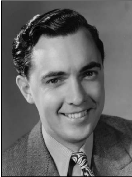
Photograph by Alfredo Valente