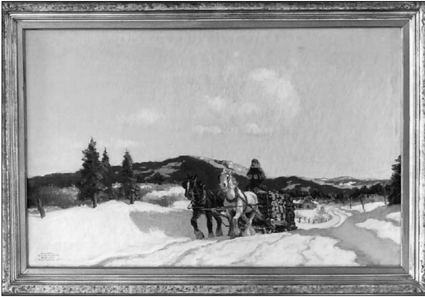
Frederick Simpson Coburn, On the Logging Road, Eastern Townships, Oil on canvas, 69.0 x 100.0 cm, Bishop's University Art Collection

(lonely fishermen, empty boats or farm animals grazing in the fields), Edson's emphasis was on the primitive aspect of a wilderness barely touched by human presence. Referring to a particular painting, Mount Orford, Morning , an art critic for the Montreal newspaper the Gazette , wrote on March 6, 1871: